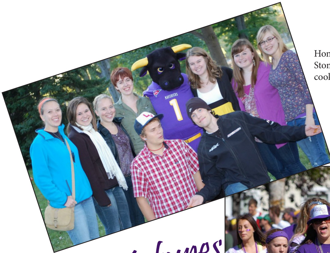
Honors students get cozy with Stomper at the annual fall cookout.