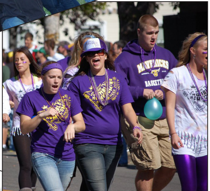
Honors students contributed to the MSU homecoming festivities.