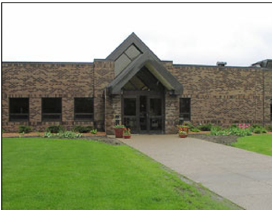
The Minnesota Correctional Facility at Shakopee houses more than 650 female prisoners.