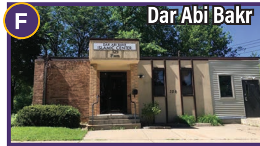
F Dar Abi Bakr