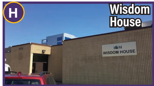
H Wisdom House