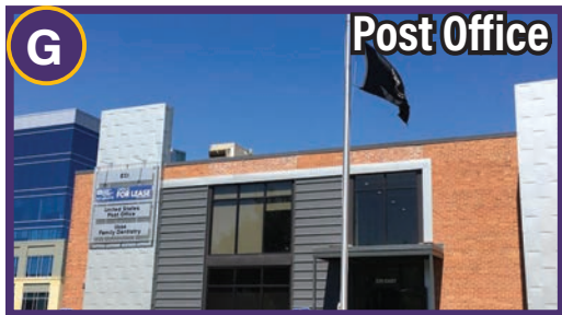
G Post Office