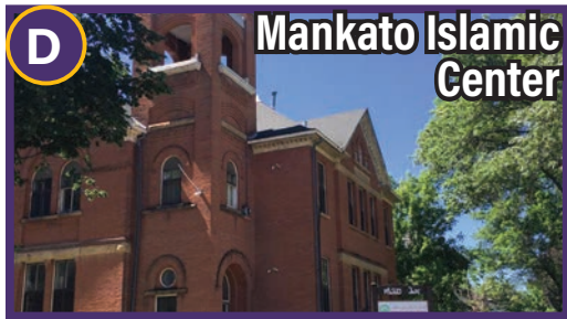
D Mankato Islamic Center