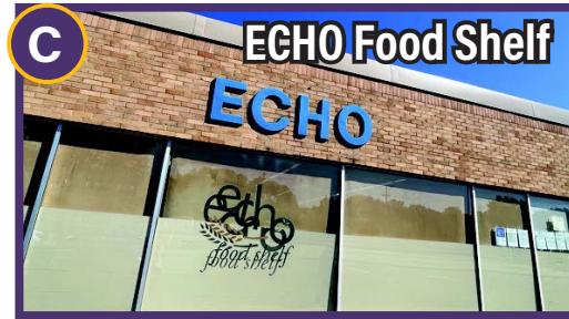
C ECHO Food Shelf