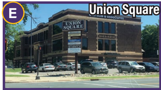
E Union Square