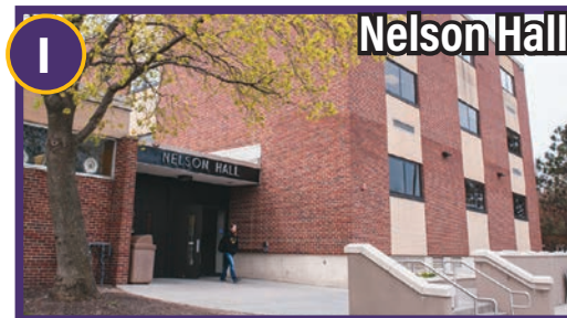
I Nelson Hall