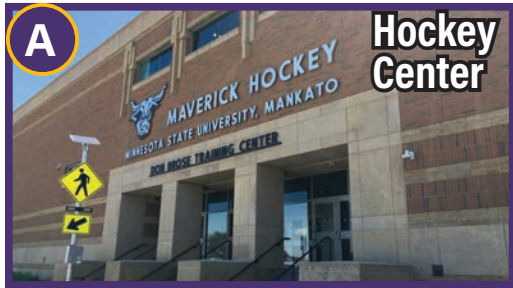
A Hockey Center

The new BUS ROUTE 7 will operate 10:00 A.M. to 10:00 P.M., Monday through Friday, making trips from Nelson Hall to Downtown Mankato every 30 minutes.