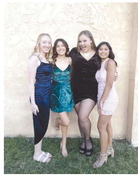
MEMBERS AT FORMAL

We held our annual moonball event this past spring and were able to raise $1,000 for our local girls on the run organization. We are also extremely proud to have had three of our members on the panhellenic council for the year of 2022! One goal we have for next year is to continue to personally grow as a chapter. With COVID-19 restrictions being lifted we want to better our sisterhood, making sure we can be the 'best' gamma phi beta woman we can't Minnesota State Mankato and our community!