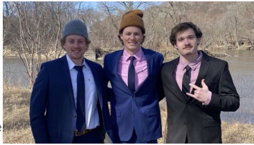
BIG BUSINESS AHEAD. #CHOPSONTOP

This year Lambda Chi Alpha has initiated 5 new members into our brotherhood. We as a group have been able to get a new chapter house which is very exciting and have had many fun brotherhoods together. Bag drop for our philanthropy feeding America went well.