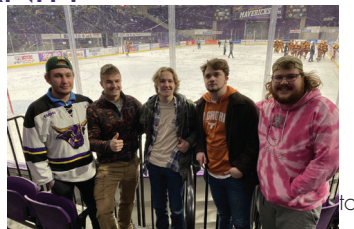
BROTHERS OF PHI KAPPA PSI SHOWING OUR SUPPORT FOR OUR SPORT PARTNERS, THE WOMEN'S HOCKEY TEAM.

Our chapter was able to raise over $1600 during the academic year to support the Big Brother, Big Sister Program at the YMCA. We were able to initiate our first spring class since the start of the pandemic. We also had the great honor of winning the 2021 Homecoming trophy. One of our goals for the upcoming academic year is to secure funding for chapter house improvement projects, such as refinishing our floors.