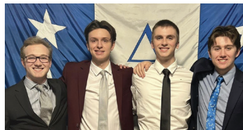
PHI DELTS GATHER FOR THEIR ANNUAL FOUNDER'S DAY EVENT.

This last year Phi Delta Theta was able to recruit 8 amazing men into the chapter, almost doubling the size of our chapter during these difficult times. We have also been able to volunteer all over the community, at events like a benefit for a local man who was recently diagnosed with ALS, the homecoming parade and concert. In the fall we were able to raise close $1,000 for our philanthropy, Livetikelou. We are looking forward to the future of the chapter and to see what our new recruits will do and how far they will go.