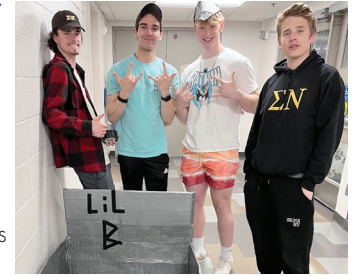
SIGMA NU'S GREEK WEEK CARDBOARD BOAT REGATTA.