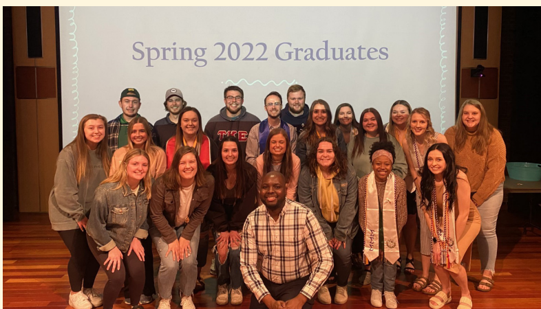
CONGRATULATIONS TO THE 61 FRATERNITY AND SORORITY LIFE UNDERGRADUATES