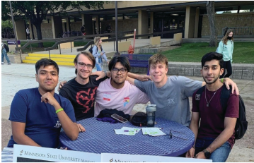
MEMBERS OF SIGMA CHI HOSTED SEVERAL EVENTS AS PART OF MENTAL HEALTH AWARENESS

The Kappa Tau Chapter is very proud to announce that we have raised $2,527.93 for our philanthropy (Huntsman Cancer Institute) which is the