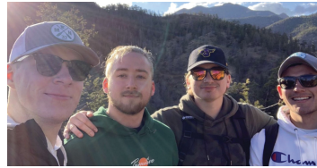
MEMBERS OF PHI DELTA THETA GATHER FOR SOME OUTDOOR ADVENTURES.

Phi Delta Theta Minnesota Beta has been very active on campus this last semester. We held our semester philanthropy event, Phi Delta Theta Car Smash, and raised over $1,000 for the Live Like Lou foundation. As a chapter, we grew our members from 10 to 16 men, our new members are already taking on leadership roles, and we are excited to see how they improve the chapter. One goal we have for the upcoming year is to double the size of our chapter.