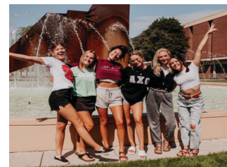
MEMBERS OF ALPHA CHI OMEGA CELEBRATE BY MINNESOTA STATE MANKATO'S ICONIC FOUNTAIN.

Two things that Alpha Chi accomplished this past year was our continuous success to support CADA and raise awareness for domestic violence, along with that we are so proud of and super excited for our amazing new member class who have portrayed so much love for Alpha Chi! Our main focus for this year is to strengthen our bonds within the chapter and with our community whether it's with Greek Life or other RSO's.