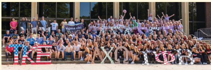
MEMBERS OF THE MINNESOTA STATE MANKATO FRATERNITY & SORORITY COMMUNITY GATHER FOR A GROUP PHOTO AFTER BID DAY FESTIVITIES IN FALL 2021.

Assistant Director of Student Activities