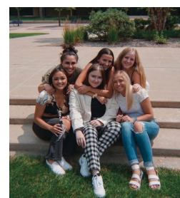
ASAS TAKE ADVANTAGE OF A BEAUTIFUL DAY ON CAMPUS.

This last year we are so proud to say was a great year! We won the 2020 Chapter of the year at the awards banquet, and we have continued our hard work with recruitment and got quota through formal recruitment for the first time in quite a few years. A goal we have for next year is to continue to strengthen our relationships with the other chapters in FSL and other RSO's on campus.