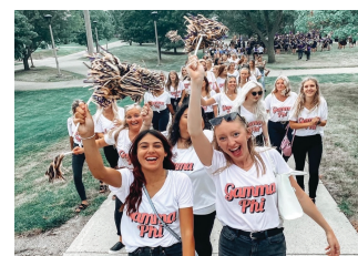
MEMBERS OF GAMMA PHI BETA CELEBRATE BID DAY IN FALL 2021.

This year we had the unique challenge of balancing the spring semester being online due to the virus and the fall semester being completely back in-person. However, we were still able to accomplish many things during this time. We introduced the new position of Belonging, Equity, Diversity, and Inclusion Chairwomen into our chapter. With this position we are strengthening our four core values of Love, Labor, Learning, and Loyalty by educating sisters on how to understand, appreciate and interact with people from cultures or belief systems different from one's own. Additionally, with Covid restrictions in the spring we were able to hold our annual philanthropy event, Moonball, which contributes to the Girls on the Run Organization in October. Looking forward to next semester we can't wait to welcome our next executive officer board.