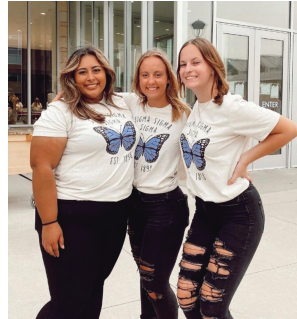
MEMBERS OF TRI-SIGMA GATHER TO HELP WELCOME NEW STUDENTS AT MAVFEST