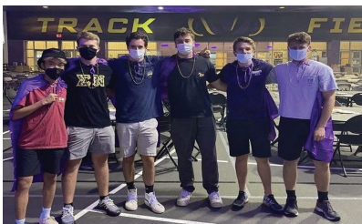
SIGMA NU MEN JOIN IN ON THE FESTIVITIES, VOLUNTEERING AT GALACTIC BINGO DURING WELCOME WEEK.